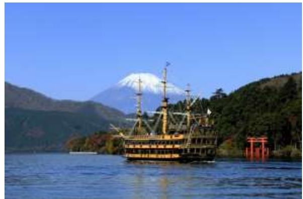
Hakone Pirate Ship Victory